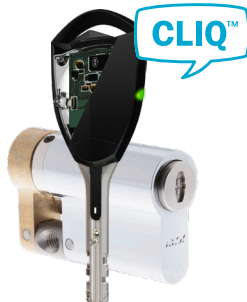
PROTEC 2 CLIQ