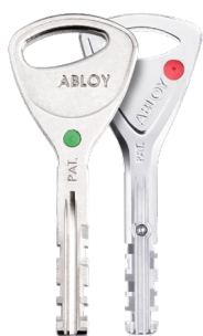
MECHANICAL KEY MANAGEMENT

OS INCEDO adds operational efficiency by connecting all mechanical, electromechanical and digital solutions into one cloud-based application. This includes PROTEC 2 CLIQ, mobile access solutions and a wide range of mechanical key management features.