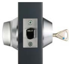
ME153 ME154 c/LC801 c/LC802