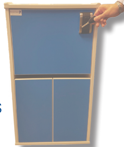
POD - Patient's own dispensing

ABLOY RFID locker locks provide a seamlessly integrated, retrofittable solution for management of patient lockers.