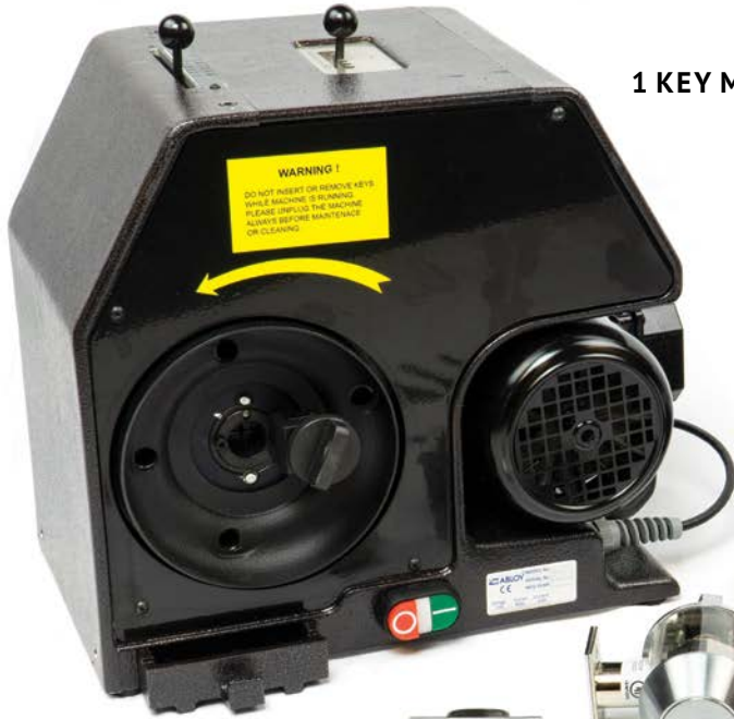
1 KEY MACHINE LT103